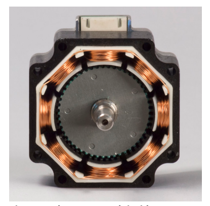
Figure 1: The many teeth inside a stepper motor.

The stepper motor's position is known by the number of input pulses or steps commanded. A common stepper motor can have 1.8 degrees mechanically per step, which results in 200 steps per revolution. Manufacturers will spec a step angle accuracy of 3 to 5 percent of one step noncumulative in a typical stepper motor.