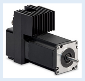
Tolomatic is a leading supplier of electric linear actuators. Tolomatic's 60+ years of expertise covers a wide range of industries and linear motion applications.