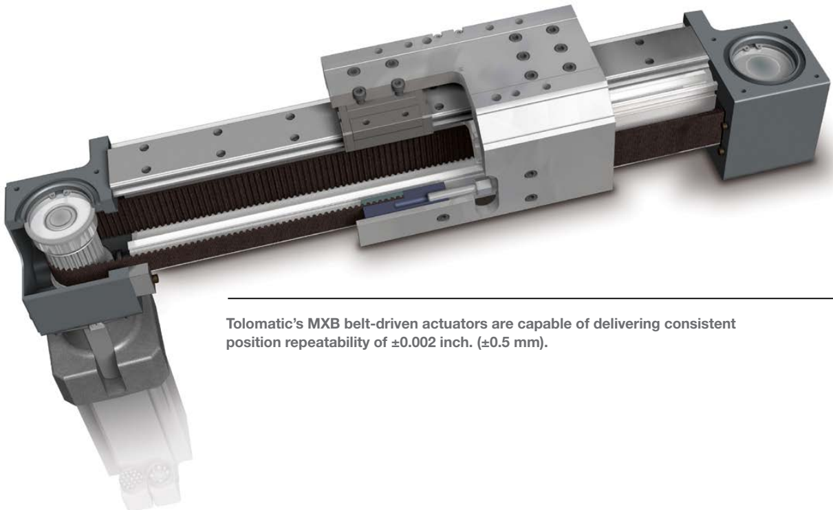
Tolomatic's MXB belt-driven actuators are capable of delivering consistent position repeatability of \pm 0.002 inch. ( \pm 0.5 mm).