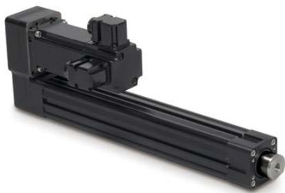
The Tolomatic RSA rod-style actuator series is designed for high performance, high thrust, durability and compact mounting flexibility.

That’s when Chamberlain consulted with Brian Mulholland of Hughes Hi-Tech in